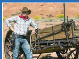
CULTURE & SYMBOLS