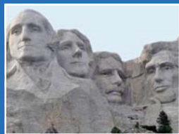
HISTORY & GEOGRAPHY