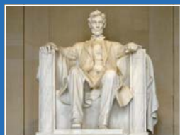
GOVERNMENT & POLITICS