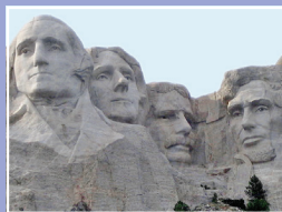
HISTORY & GEOGRAPHY