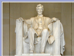
GOVERNMENT & POLITICS