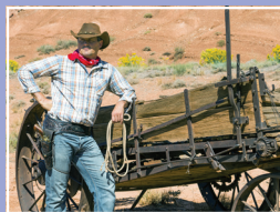
CULTURE & SYMBOLS